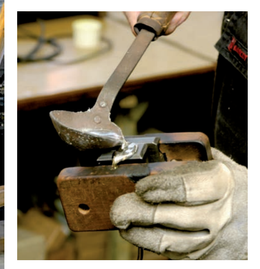
A living and working museum

Experience Industrial History at First Hand