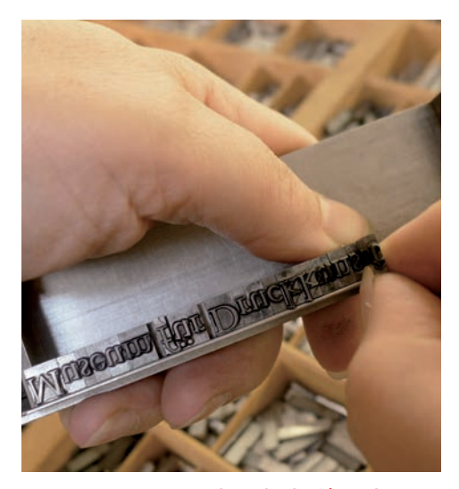
at Nonnenstrasse 38 in Leipzig-Plagwitz